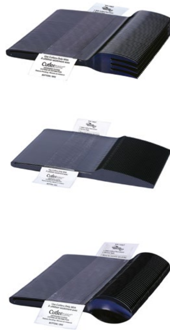
CUTLERY REFILL PACKS